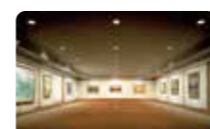
Narukawa Art Museum