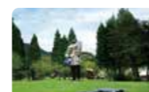
The Hakone Open Air Museum