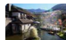
Hakone Venetian Glass Museum