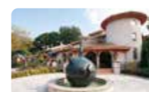
Museum of The Little Prince and Saint-Exupéry