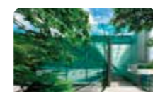
PoLa Museum of Art

★ Discount admission to museums listed here with Hakone Freepass