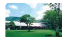
Lalique Museum, Hakone